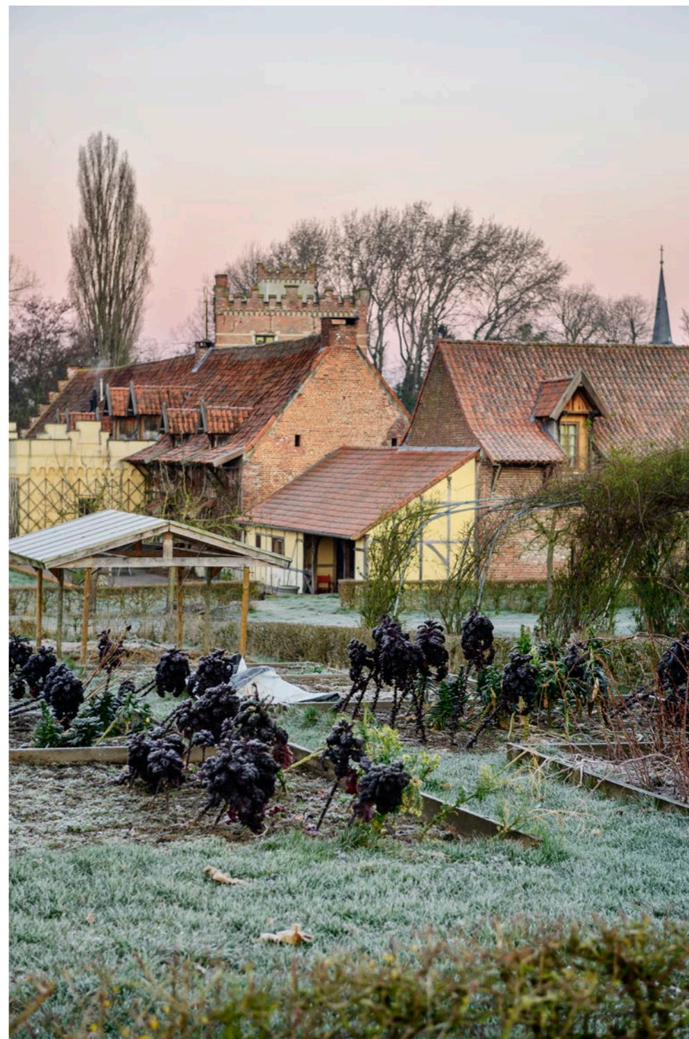
A picturesque historic farm in a fruit-growing centre of Belgium has been carefully restored and turned into a gastronomic inn served by its own produce

WORDS MIRJAM ENZERINK